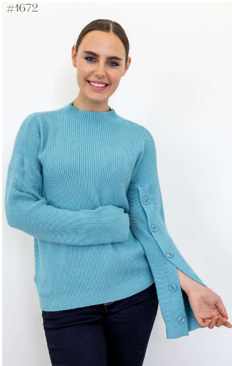
Ribbed Crew Neck Pullover