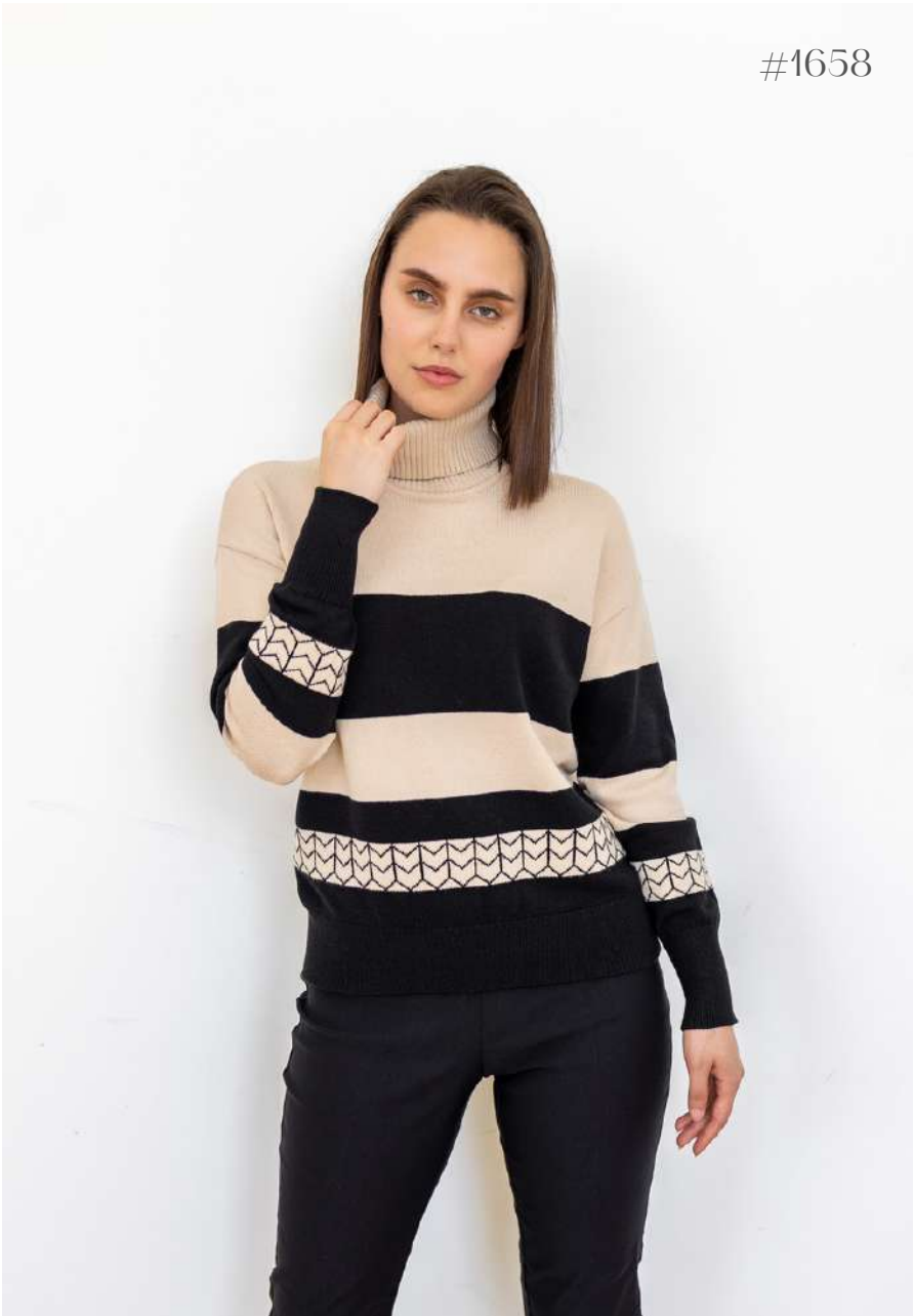
Stripped Turtleneck Pullover Made with Recycled Polyester