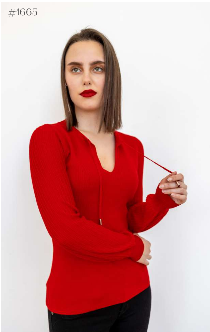
V-Neck Tie Front Pullover