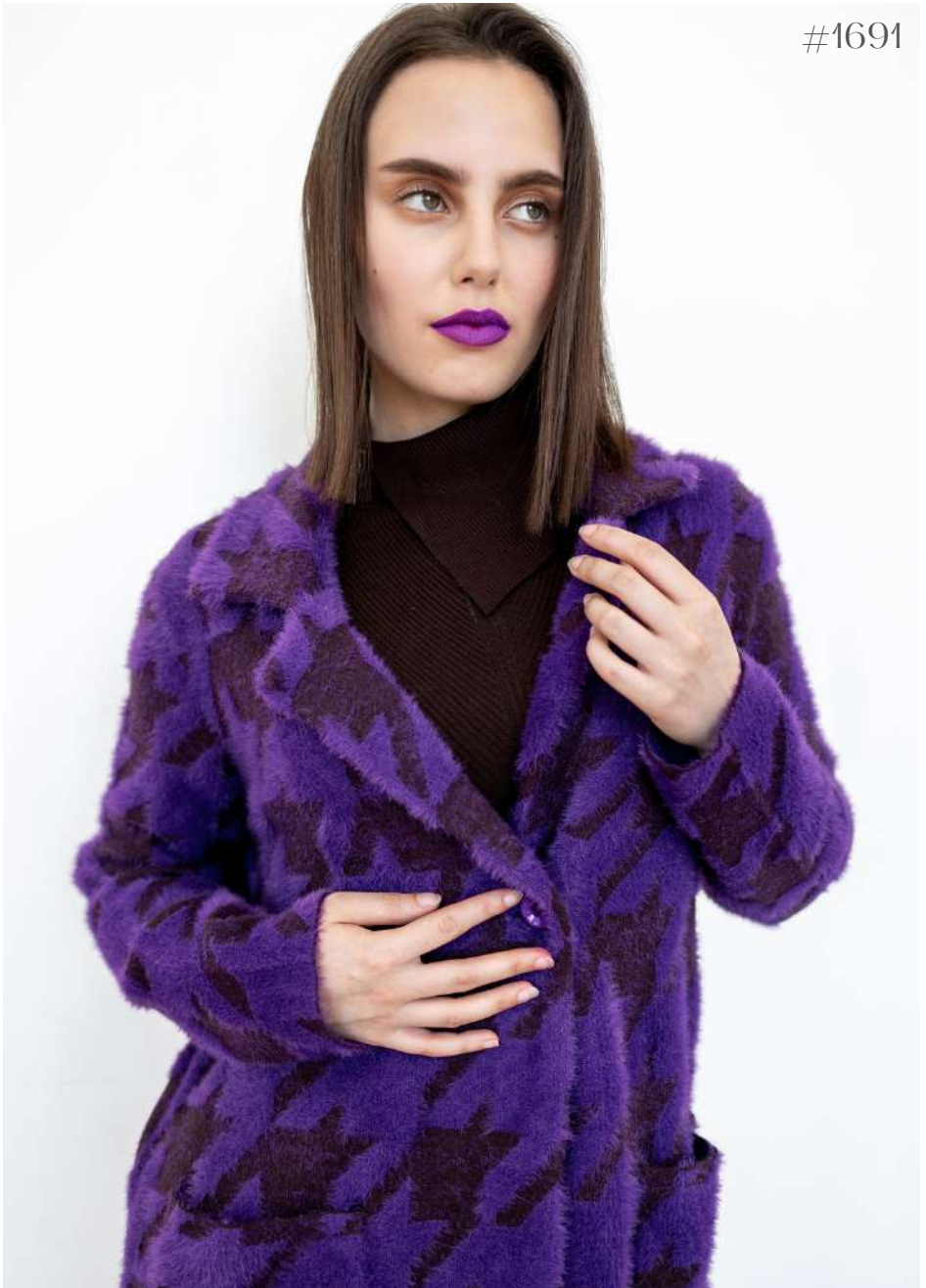
Houndstooth Pattern Coatigan